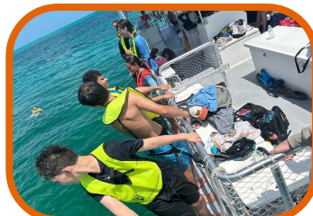
Students jumping off the side of the boat.