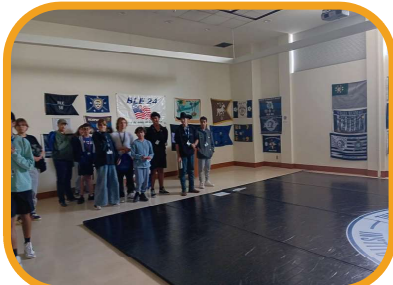
Students watch a demonstration in the Law Enforcement gym.