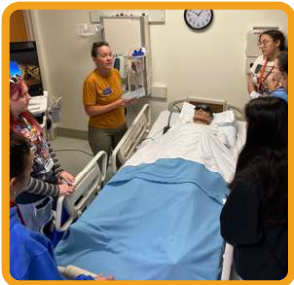
Students observe the life-like training mannequin in the nursing room.